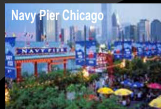
Navy Pier Chicago

Chicago City Tour Architecture River Cruise Tour Magnificent Mile Michigan Avenue Millennium Park Art Institute of Chicago Chicago Cultural Center Shedd Aquarium The Field Museum Willis Tower Navy Pier Illinois Holocaust Museum Chicago Botanic Gardens Baha'i Temple