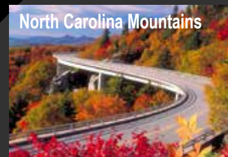
North Carolina Mountains

Asheville Art Museum Colburn Earth Science Museum North Carolina Arboretum Grove Arcade Chimney Rock Blue Ridge Mountain Oprey Show Basilica of St. Lawrence Biltmore Estate & Gardens Biltmore Village and Winery Grandfather Mountain Blue Ridge Parkway & Folk Art Ctr Hendersonville Flat Rock Playhouse Thomas Wolfe Memorial