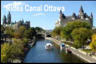
Rideau Canal Ottawa

National Gallery of Canada Canadian War Museum Canadian Museum of Nature Science and Technology Museum Canadian History Museum Peace Tower & Parliament Hill Supreme Court Changing of the Guard ByWard Market Shopping District Rideau Canal Boat Tour Currency Museum