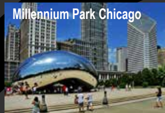
Millennium Park Chicago

Chicago City Tour Architecture River Cruise Tour Magnificent Mile Michigan Avenue Millennium Park Art Institute of Chicago Chicago Cultural Center Shedd Aquarium The Field Museum Willis Tower Navy Pier Illinois Holocaust Museum Chicago Botanic Gardens Baha'i Temple