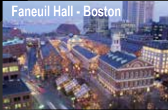
Faneuil Hall - Boston

Boston Day Trip: City Tour, JFK Library, Vilna Shul, Faneuil Hall and Quincy Market